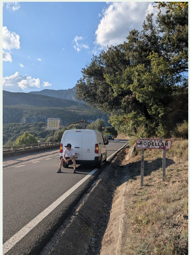
Sergio climbing and traveling by camper van while building Gora.